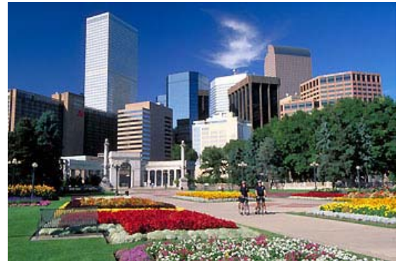
Denver Parks and Recreation