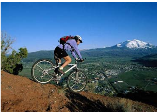
Carbondale Parks and Recreation