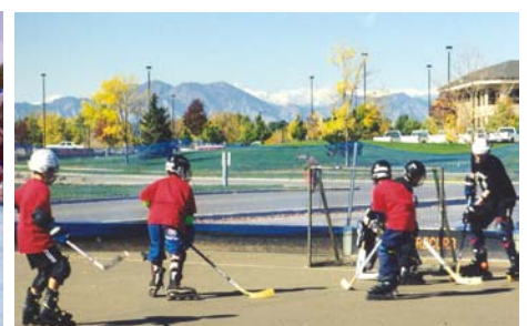
City and County of Broomfield