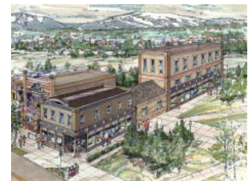
Breckenridge Community Survey