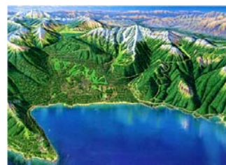
North Lake Tahoe Community Survey