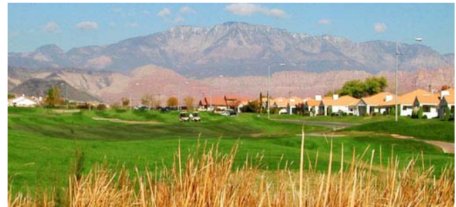
Washington City, Utah Community Survey