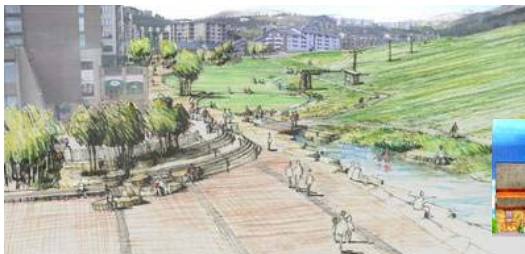
Steamboat Springs Community Survey