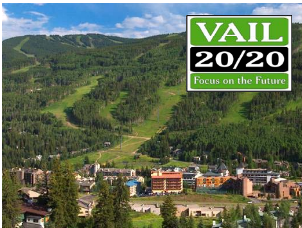
Town of Vail Community Survey | The State of Vail Project