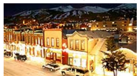
Breckenridge Community Survey